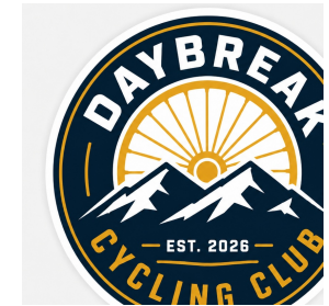
Secondary circular badge