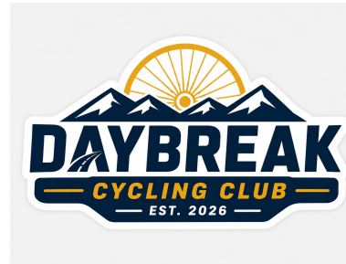
Primary bike sticker | frames, bottles, jerseys, website